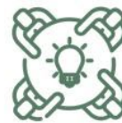
Concentrated Stakeholder and Public Engagement