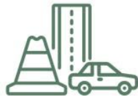
Coordinated Construction Activity